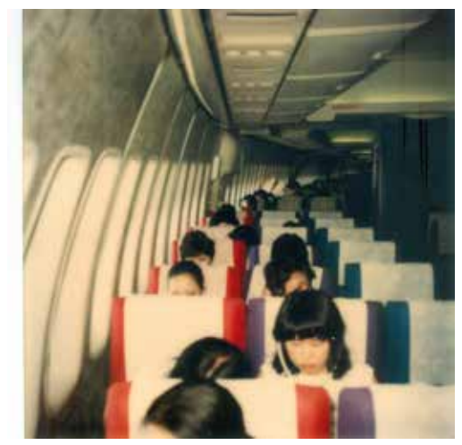
JAPAN AIRLINES B747-100SR. DOMESTIC ROUTES. ZONES A to E