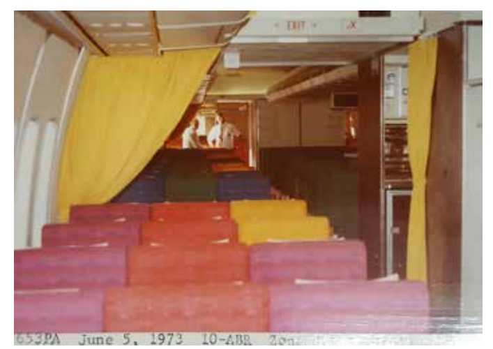
PAN AM B747-100. San Juan Route. B Zone