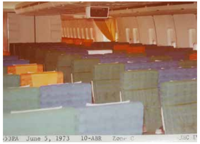
PAN AM B747-100. San Juan Route. C Zone