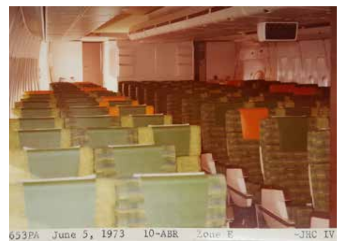
PAN AM B747-100. San Juan Route. E Zone