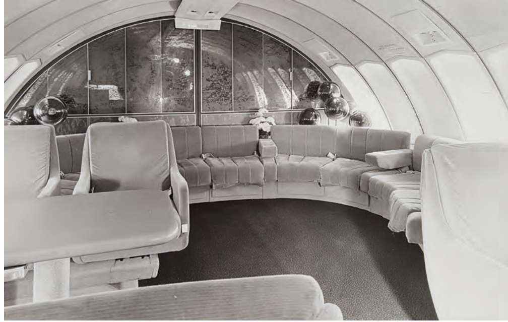
ABOVE: THE UPPER DECK OFFERED SEVERAL SEATING OPTIONS TO SUIT VARIOUS PASSENGER PREFERENCES