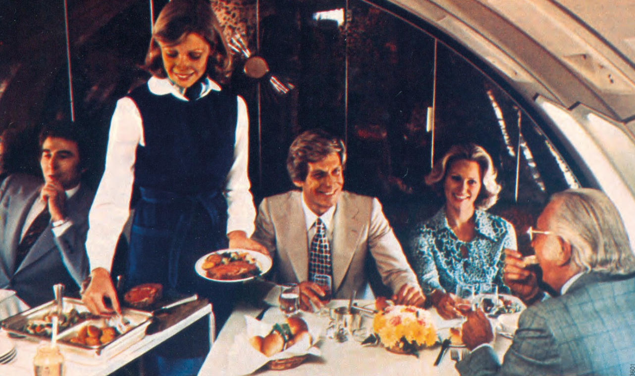
LEFT: THE PRIME RIB ROAST WAS A HIGHLIGHT OF THE PRESIDENT SPECIAL DINNER

where each passenger would sit, streamlining the seating process.”