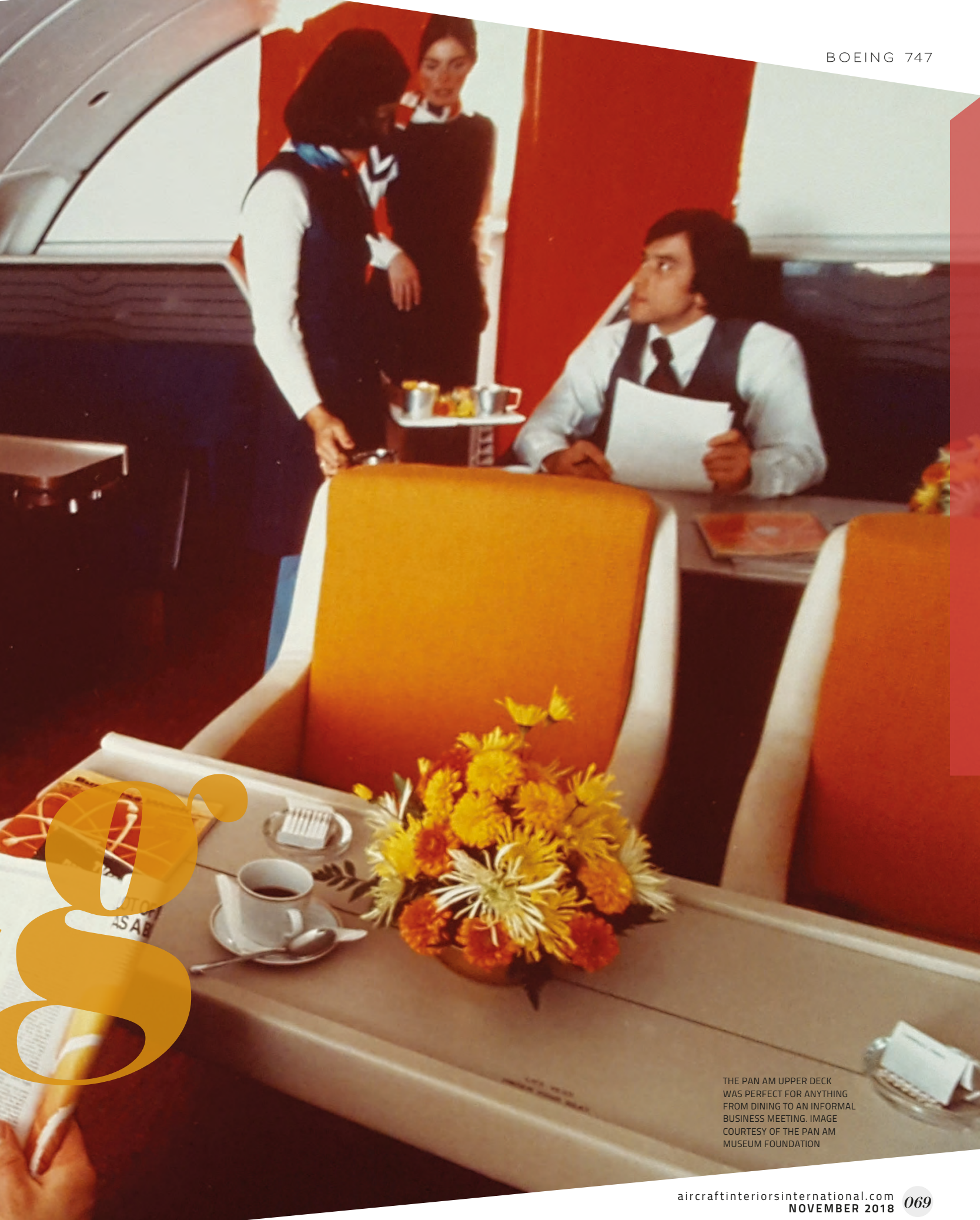
THE PAN AM UPPER DECK WAS PERFECT FOR ANYTHING FROM DINING TO AN INFORMAL BUSINESS MEETING.