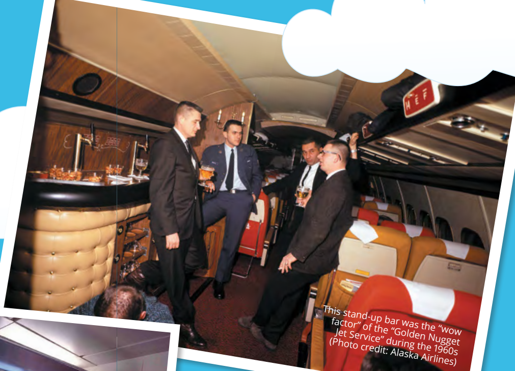
This stand-up bar was the "wow factor" of the "Golden Nugget Jet Service" during the 1960s