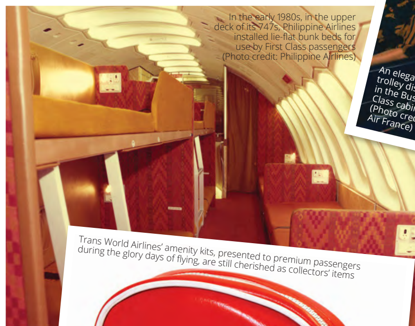
In the early 1980s, in the upper deck of its 747s, Philippine Airlines installed lie-flat bunk beds for use by First Class passengers