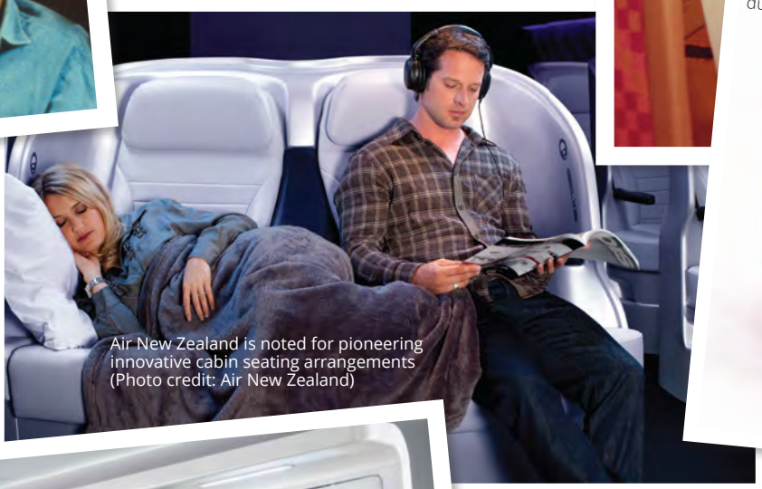
Air New Zealand is noted for pioneering innovative cabin seating arrangements