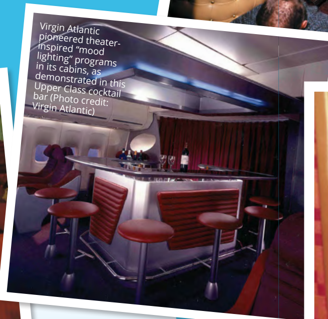
Virgin Atlantic pioneered theater-inspired "mood lighting" programs in its cabins, as demonstrated in this Upper Class cocktail bar