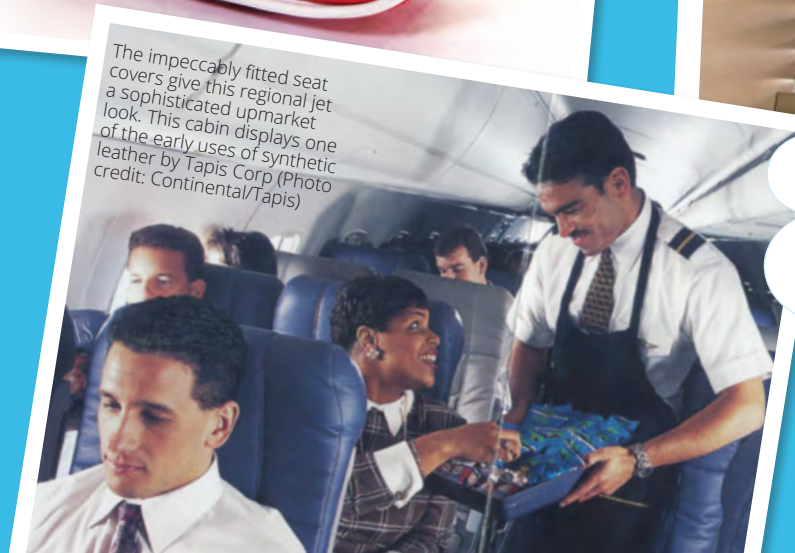
The impeccably fitted seat covers give this regional jet a sophisticated upmarket look. This cabin displays one of the early uses of synthetic leather by Tapis Corp

Grateful acknowledgement is given to the airlines and other organizations credited for their permission to use their photographs in Jetliner Cabins: Evolution & Innovation . There are other images that come from other publicly available sources; for example, company sales brochures and websites. Pictures that are displayed without photo credits come from the collection of J. Clay Consulting.