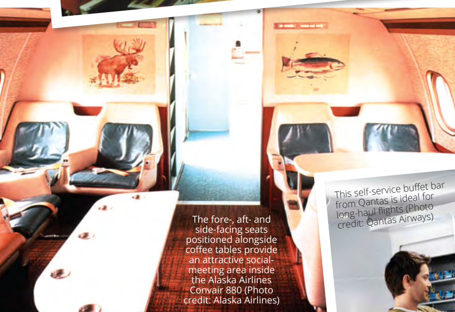
The fore-, aft- and side-facing seats positioned alongside coffee tables provide an attractive social-meeting area inside the Alaska Airlines Convair 880