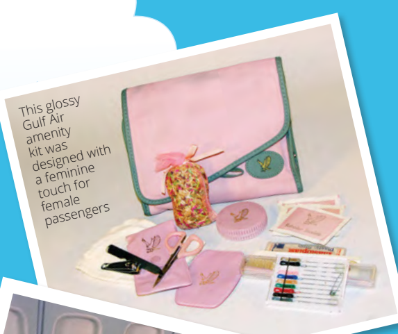
This glossy Gulf Air amenity kit was designed with a feminine touch for female passengers