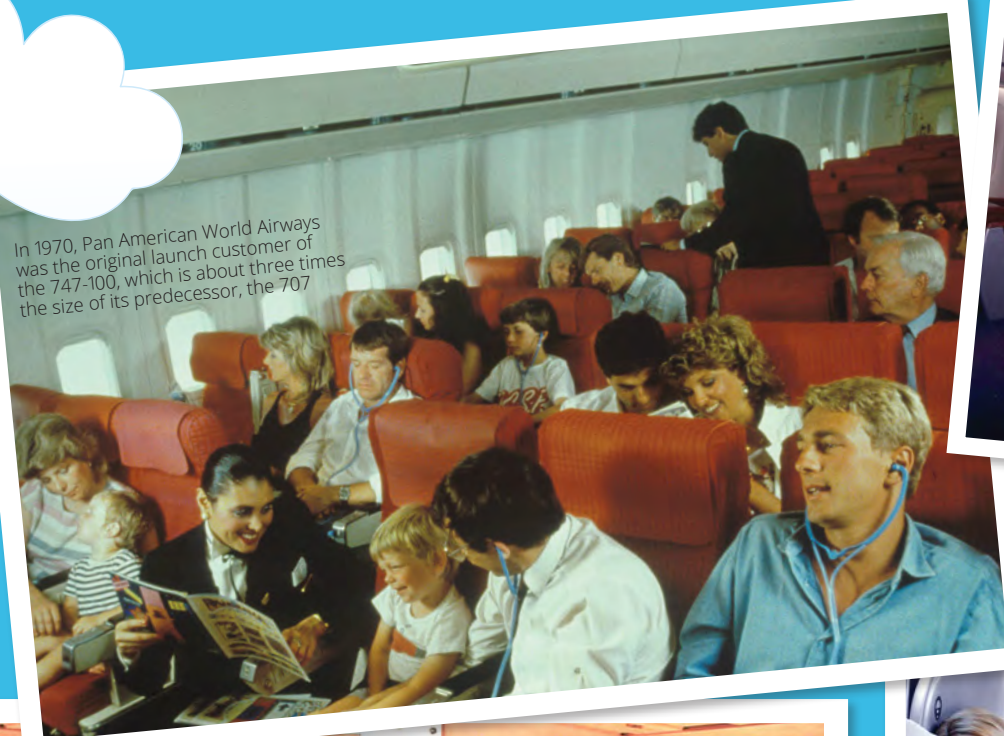
In 1970, Pan American World Airways was the original launch customer of the 747-100, which is about three times the size of its predecessor, the 707