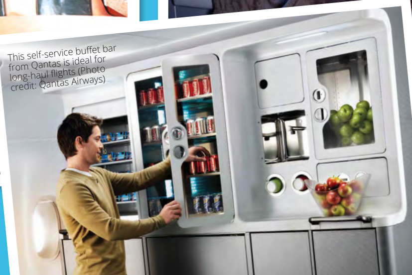
This self-service buffet bar from Qantas is ideal for long-haul flights