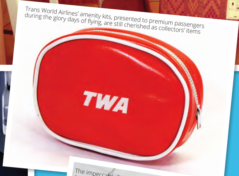
Trans World Airlines' amenity kits, presented to premium passengers during the glory days of flying, are still cherished as collectors' items