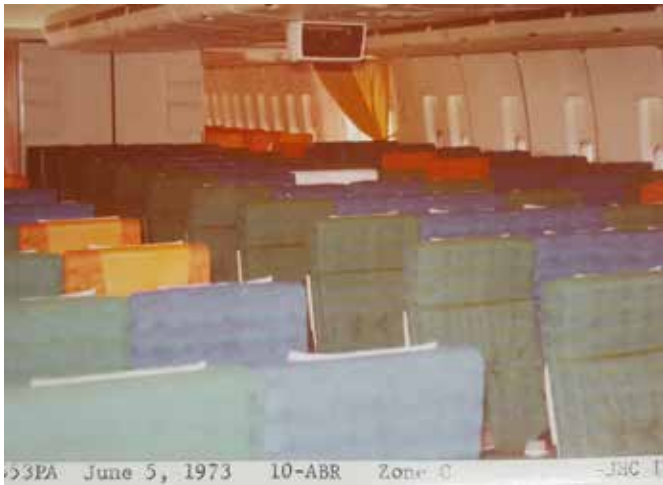
PAN AM B747-100. San Juan Route. C Zone