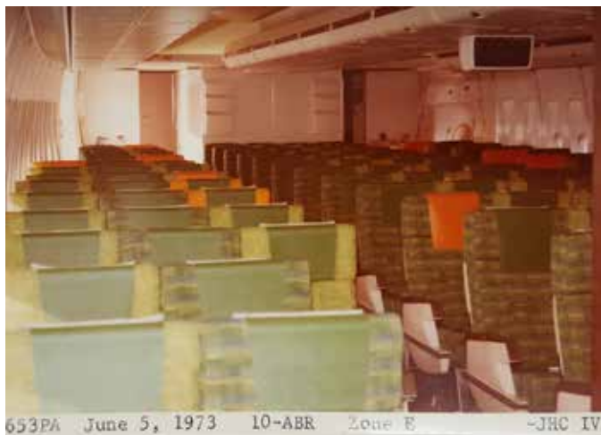
PAN AM B747-100. San Juan Route. E Zone