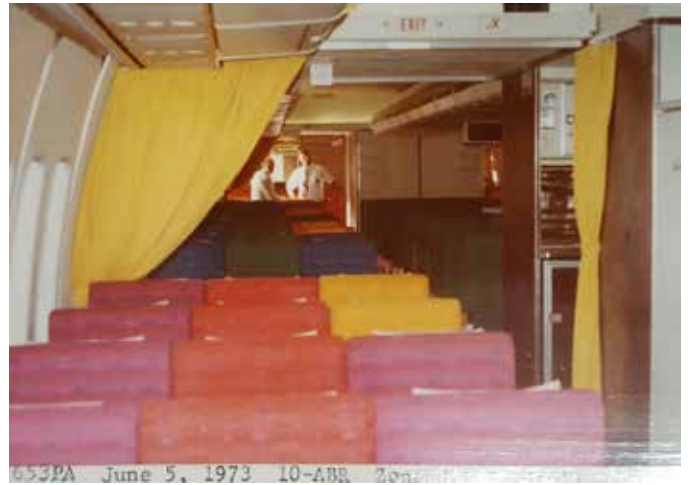
PAN AM B747-100. San Juan Route. B Zone