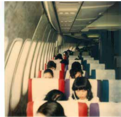
JAPAN AIRLINES B747-100SR. DOMESTIC ROUTES. ZONES A to E