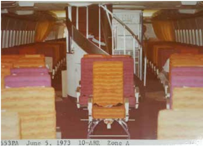
PAN AM B747-100. San Juan Route. A Zone